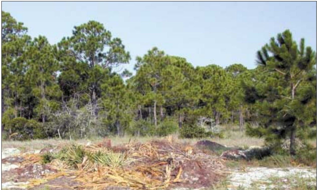
Figure 16. Illegal dumping of plant material.