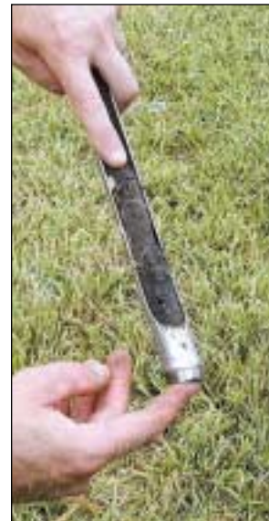
Figure 23. Soil Core

The IFAS Everglades Extension Soils Laboratory currently uses acetic acid to extract nutrients from all organic soils. Therefore, the extractants are calibrated to different soil types. These extraction procedures must be ascertained when approaching any laboratory for a soil analysis. The routine analysis includes a lime requirement determination if the soil pH is below 6.0. N is not determined, because in most soils it is highly mobile and its soil status varies greatly with rainfall and irrigation events.