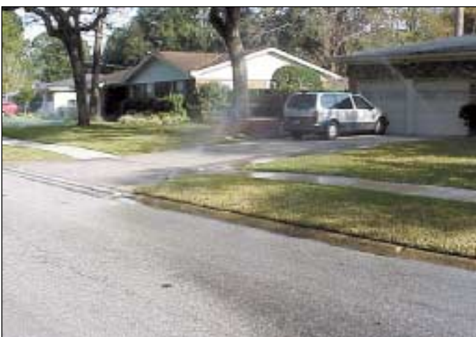
Figure 11. Overirrigation runoff. Small turf area should be irrigated with spray heads, not sprinklers.

Common irrigation efficiency problems include leaks, sprinkler head plugging, poor irrigation uniformity caused by nozzle wear, and poor system pressure. Fixing some problems (such as repairing leaks and replacing nozzles) can be accomplished at a minimal cost, while others (such as poor system design) might, at first glance, be very costly. In either case, problems need to be corrected as soon as possible to prevent the leaching of fertilizers/ chemicals and wasted water. In the long term, the investment made to improve the irrigation system pays off in reduced fertilizer/chemical and water bills.