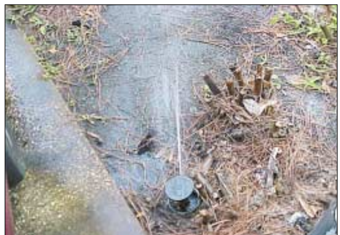
Figure 12. Object is interfering with spray pattern, resulting in poor distribution uniformity.

Figures 9–15 depict some examples of improper irrigation system design or installation.