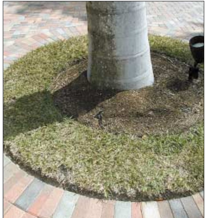
Figure 14. Mulch, not grass, should be used here.

For more information, see IFAS Publication ENH 103, Mulches for the Landscape , at http://edis.ifas.ufl.edu/MG251 .