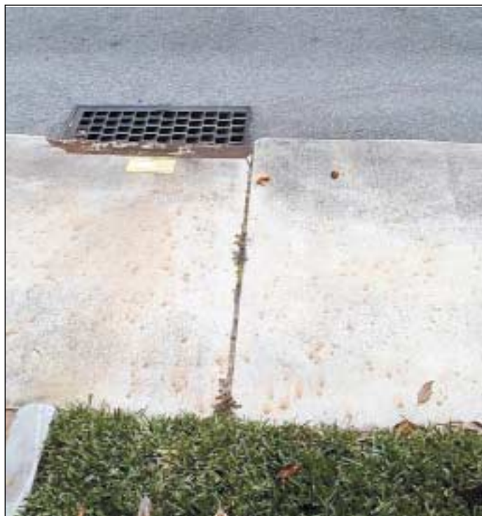
Figure 3. Poor fertilization technique wastes fertilizer, causes unsightly stains, and pollutes our waterbodies. Note the trail of stains on this sidewalk.

Inadequate nutrition results in thin, weak plants that may be more susceptible to insects, weeds, and diseases. Certain diseases, such as rust and dollar spot, can occur in turf maintained under low-nutrient conditions. Overfertilization can also enhance plant susceptibility to pests and diseases. Several pesticide applications may be required to alleviate problems that would not have been as prevalent under a proper nutrition program. Proper fertilization can alleviate these conditions.